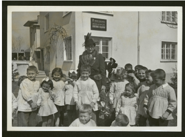
Princess Eudoxia of Bulgaria with children from the kindergarden named after her