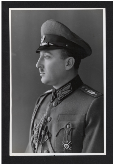
Prince Kiril of Bulgaria