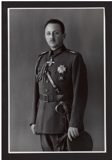
Prince Kiril of Bulgaria