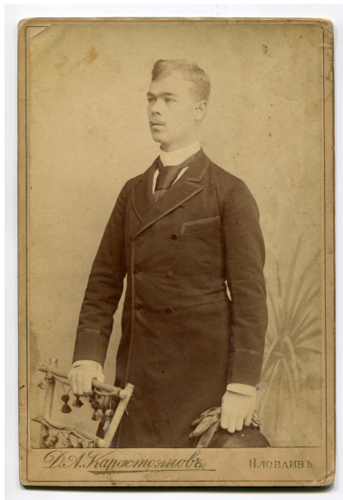
Studio portrait of a young man in urban clothes