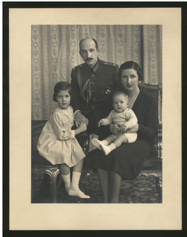
King (Tsar) Boris III and Quenn (Tsaritza) Giovanna di Savoia with their children Maria-Luisa and Simeon