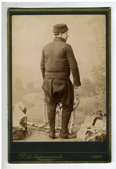
Studio portrait of a man in folk costume