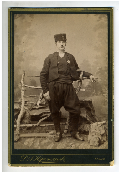
Studio portrait of a man in folk costume