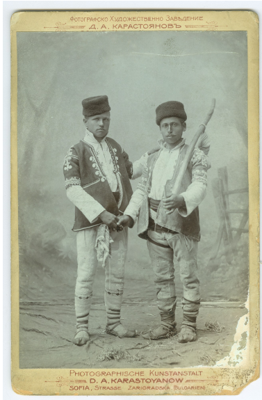
Studio portrait of two men in folk attire