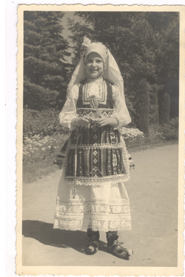
Princess Maria Louise in Bulgarian folk attire