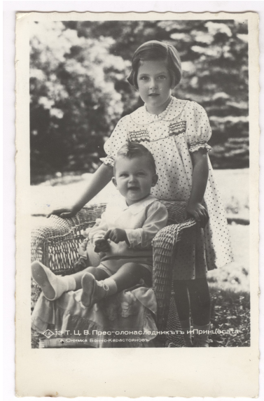
"Their Royal Majesties the Crown Prince and the Princess"