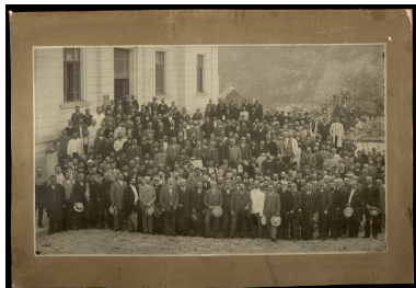
Deputies of the Fifth Bulgarian Grand Parliament