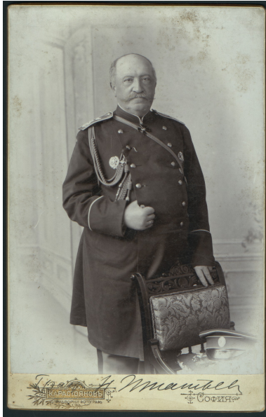
Studio portrait of Count Nikolay Ignatiev