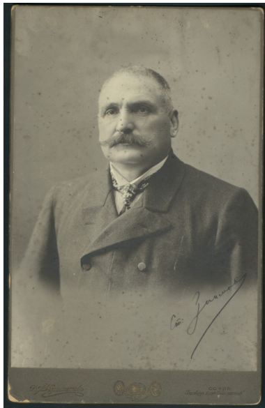
Studio portrait of Stoyan Zaimov