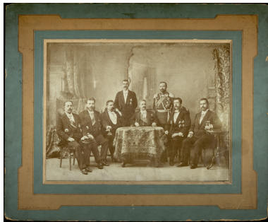
Studio portrait of Cabinet / Ministry of Prime Minister Konstantin Stoilov