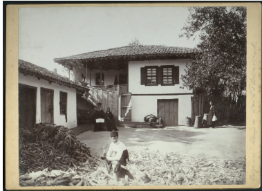
The house of priest Ivan Popevstatiev