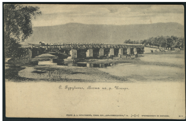
"Village Gorublyane. Bridge over Iskar river."