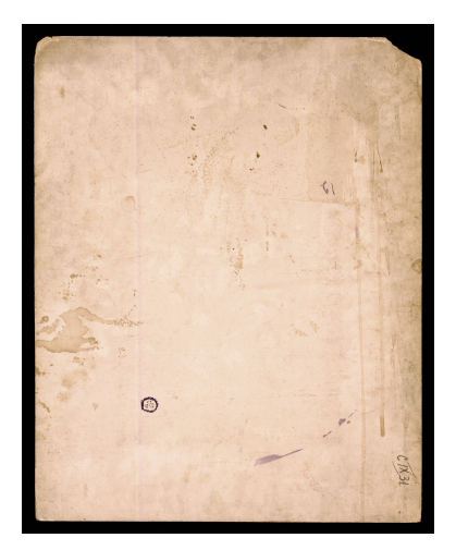
Lom high school graduates