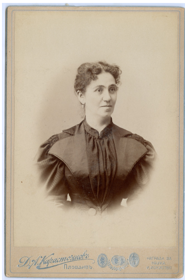
Portrait of Ekaterina Hadzhi Decheva