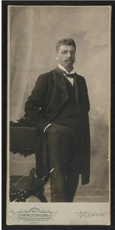
Studio portrait of Hristo Stanishev