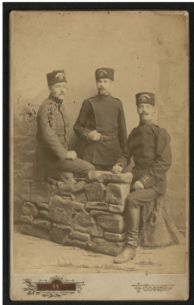
Studio portrait of three officers