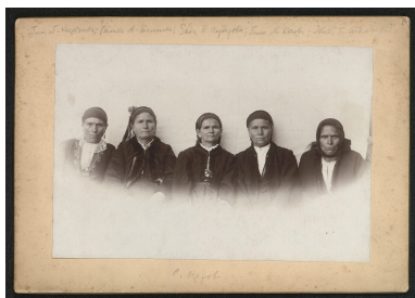
Portrait of women - wives of combatant-veterans from the Bulgarian Anti-Ottoman April Uprising 1876