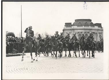
St. George's Day Military Parade