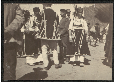
Street market