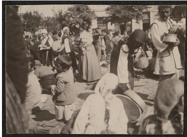
Street market