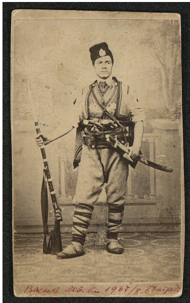
Studio portrait of Vasil Levski