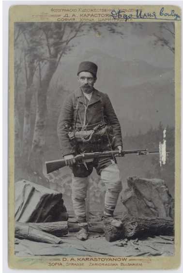
Studio portrait of Ilia Popgeorgiev