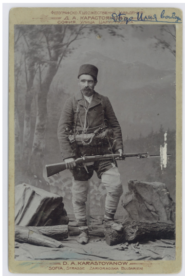
Studio portrait of Ilia Popgeorgiev