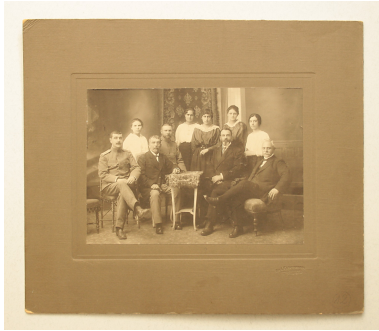
Lecturers and students at the University of Sofia's Faculty of Physics and Mathematics