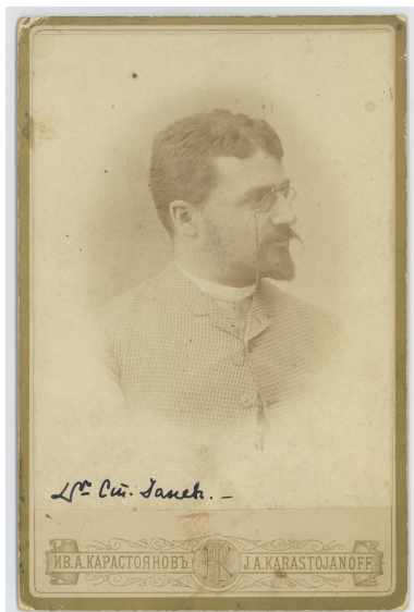
Studio portrait of Stoyan Danev