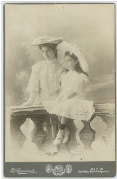
Portrait of two girls in urban clothes