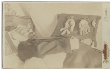
Stefan Stambolov on his deathbed