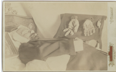
Stefan Stambolov on his deathbed