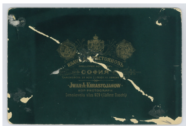
Portrait of Stefan Stambolov