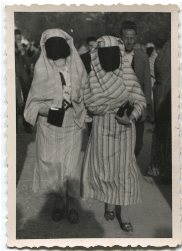
Muslim women's streetwear