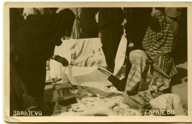
Selling handicrafts in Baščaršija