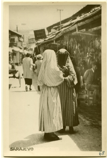
Scene in Baščaršija