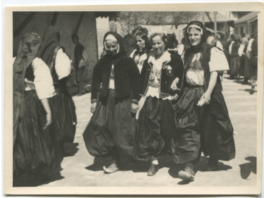
Traditional women's folk costumes