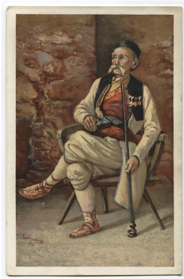
Painting of a Montenegrin © Museum of City of Sarajevo