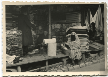
At the mercer