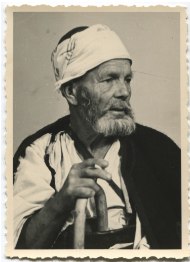
Portrait of an old Muslim man