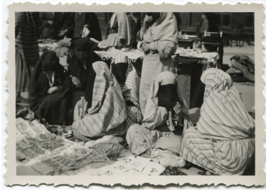
Market scene in Baščaršija