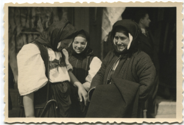
Christian women's folk costumes