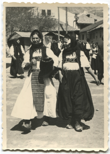
Christian women's folk costumes