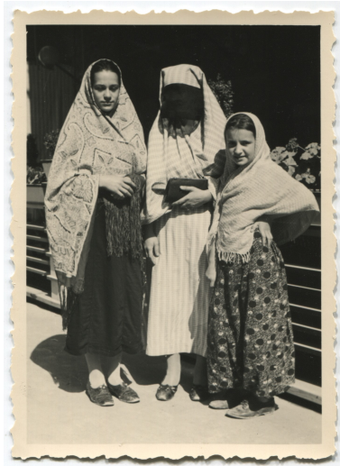
Three different types of Muslim women's dresscode