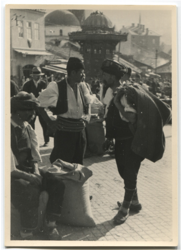
Grain trade in Baščaršija