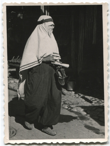
Muslim women's streetwear