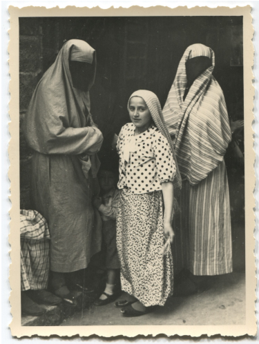
Muslim women's streetwear