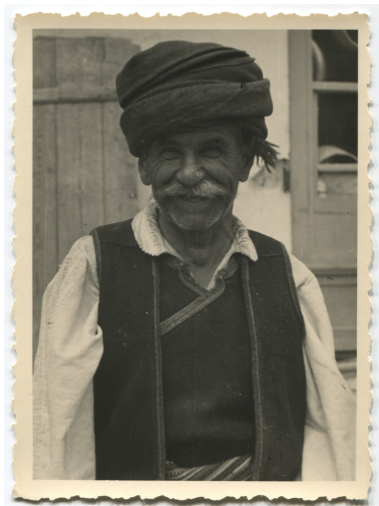
Portrait of a Serbian peasant