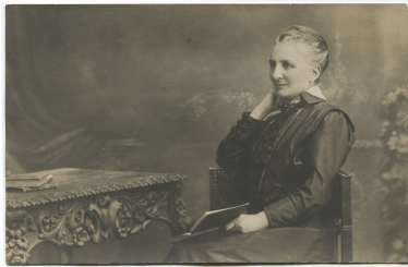
Portrait of Jagoda Truhelka