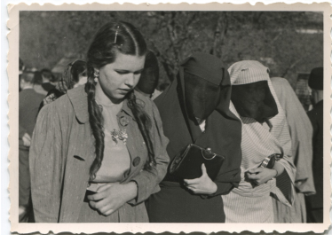
Muslim women and a girl in the street