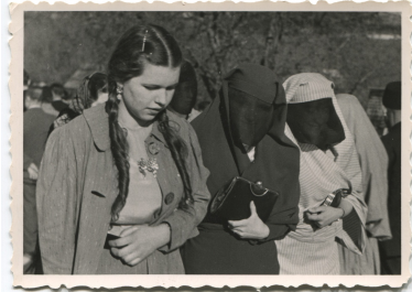
Muslim women and a girl in the street