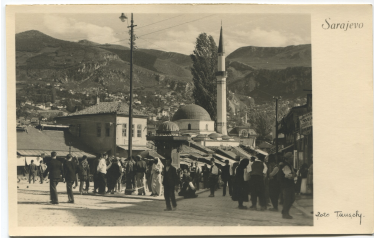
Every day life at the fountain Sebilj