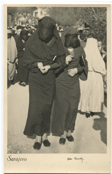
Close-up of two Muslim women in a street